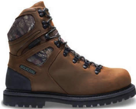
Brown/Mossy Oak W20490 Insulated NEW