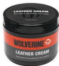
W69406 Wolverine Leather Cream 12 Per Unit