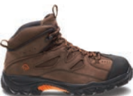
Mid-Cut Dark Brown* W02194 Steel-Toe BEST SELLER