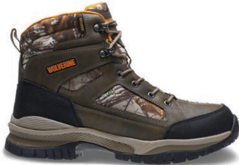
Natural/Mossy Oak Mid W20495 Non Insulated Soft-Toe NEW