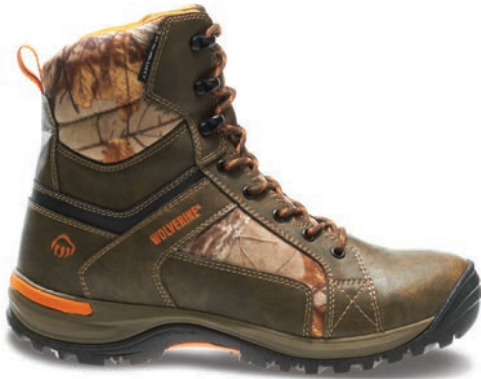
7" Natural/RealTree™ Xtra W30112 Sot-Toe/INS