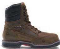
8" Brown W10627 Composite-Toe INS