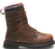
8" Brown W10082 Steel-Toe W10083 Soft-Toe