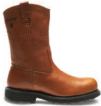
10" Brown W08377 Steel-Toe