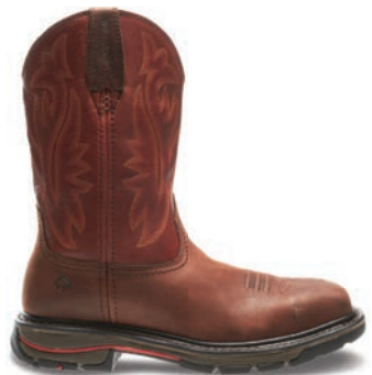
10" Dark Brown/Ox Blood W02784 Soft-Toe