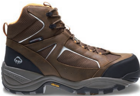
Brown W10759 Composite-Toe NEW