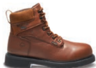
6" Brown W02563 Soft-Toe