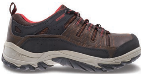
Brown W10072 Composite-Toe