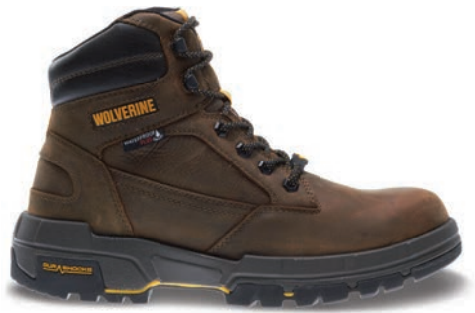
6" Brown W10656 Composite-Toe

WOLVERINE DURASHOCKS® COMFORT TECHNOLOGY