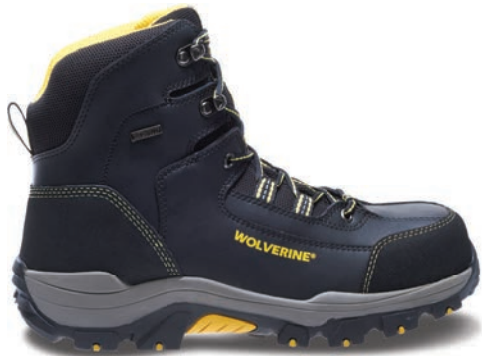
6" Black W10075 Composite-Toe