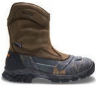
Brown W20487 Soft-Toe NEW