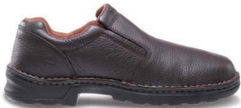
Slip-On Brown W10190 Soft-Toe