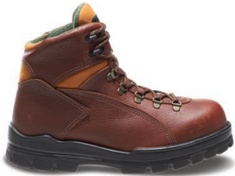
6" Brown W03779 Steel-Toe