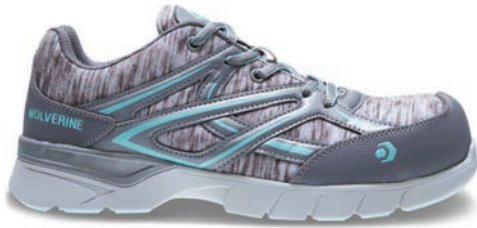
Grey/Blue W10753 Composite-Toe NEW