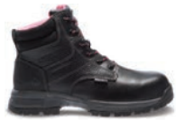
6" Black W10181 Composite-Toe