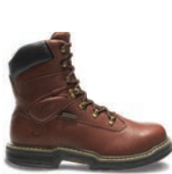
8" Dark Brown W04822 Steel-Toe** W04825 Soft-Toe