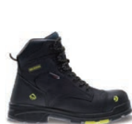
6" Black W10652 Composite-Toe