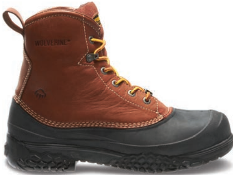
6" Brown W05698 Steel-Toe