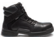
6" Black W10250 Soft-Toe