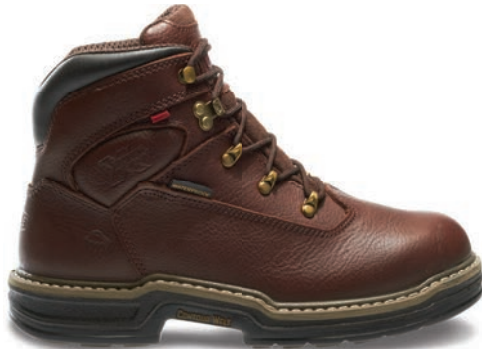
6" Dark Brown W04820 Steel-Toe** BEST SELLER W04821 Soft-Toe** BEST SELLER