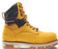
8" Wheat W10618 Composite-Toe INS