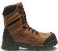
8" Brown W10506 Composite-Toe W10531 Soft-Toe