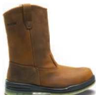
10" Brown W03258 Steel-Toe W03367 Soft-Toe