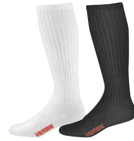
White 100 Black 001