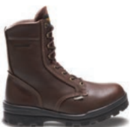
8" Brown W03176 Steel-Toe