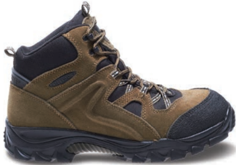
Mid-Cut Hedge/Black W04624 Steel-Toe