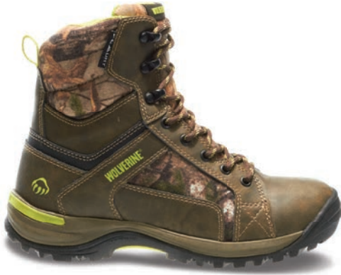
7" Natural/RealTree™ Xtra W30118 Soft-Toe/INS