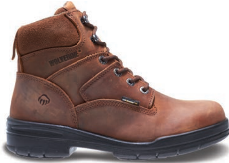
6" Brown W02053 Steel-Toe W02038 Soft-Toe