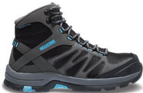
Grey/Blue W10605 Composite-Toe