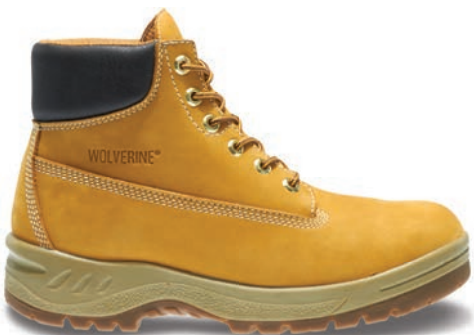
6" Gold W01134 Soft-Toe