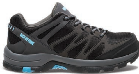
Grey/Blue W10580 Composite-Toe