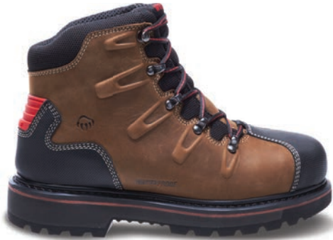
6" Brown W10263 Steel-Toe