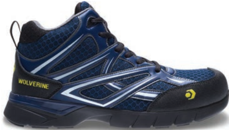
Navy W10745 Composite-Toe NEW