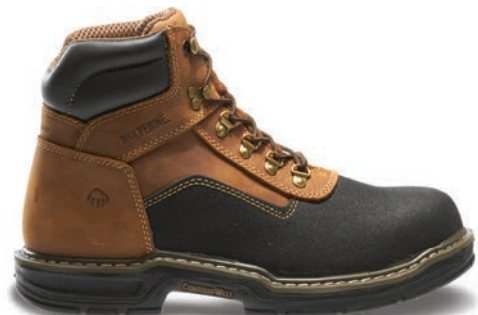
6" Brown W02252 Composite-Toe**