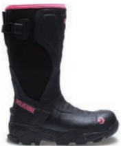
14" Black W10738 Composite-Toe NEW