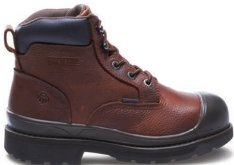
6" Dark Brown W04659 Steel-Toe