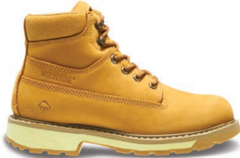
6" Wheat W01041 Soft-Toe