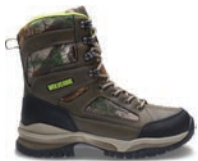
8" Natural/Mossy Oak W20496 Insulated Soft-Toe NEW