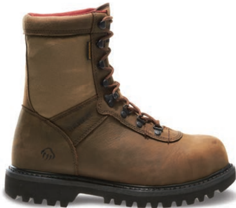
8" Real Brown W30089 Soft-Toe