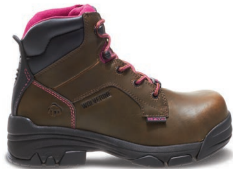
6" Brown W10383 Composite-Toe