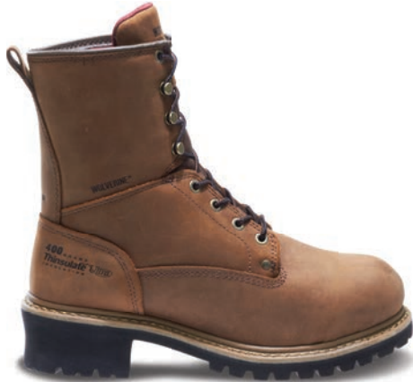
8" Brown W06077 Steel-Toe