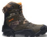
Brown/Mossy Oak W20491 Soft-Toe NEW