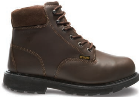
6" Dark Brown W04451 Steel-Toe