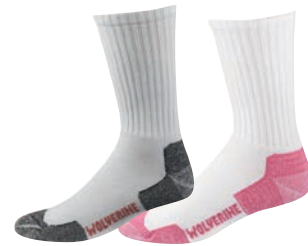
White 100 White/Pink 100