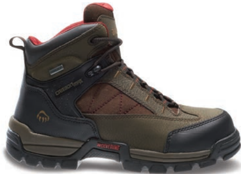
6" Brown W02362 CM Safety-Toe