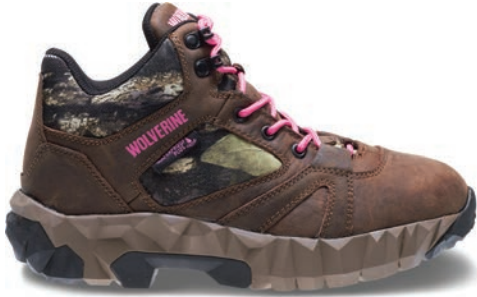
Brown/Mossy Oak Mid W20482 Soft-Toe NEW