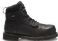
6" Black W02580 Composite-Toe