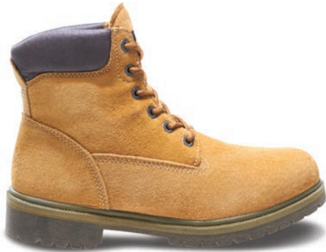
6" Gold W01191 Soft-Toe