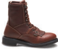
8" Kiltie* W04324 Soft-Toe