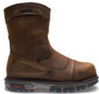
10" Dk Brown W10730 Composite-Toe NEW

WOLVERINE DURASHOCKS® COMFORT TECHNOLOGY