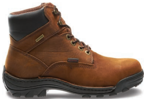
6" Brown W05483 Steel-Toe BEST SELLER W05484 Soft-Toe