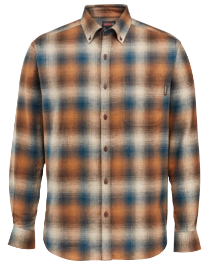
Rust Plaid 223

Colors: Black 003, Bison 202, Chestnut 231, Olive 341, Cadet Blue 435, Burgundy 601 Sizes: M – XXL