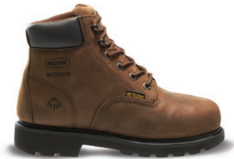
6" Brown W05679 Steel-Toe