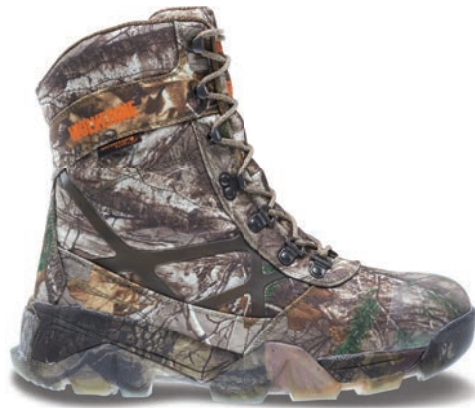
8" RealTree Xtra W20472