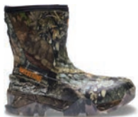
10" RealTree Xtra W20484 Soft-Toe NEW