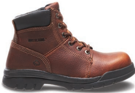
6" Brown W04713 Steel-Toe W04735 Soft-Toe