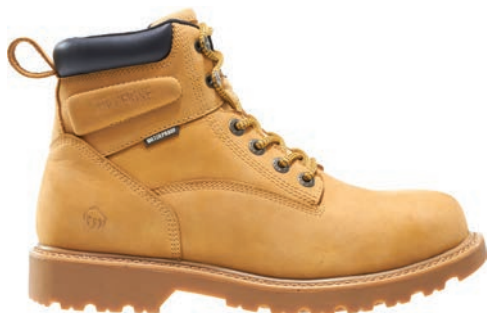
6" Wheat W10697 Soft-Toe