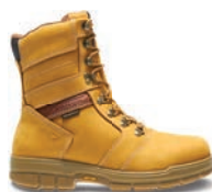
8" Gold (Nubuck) W04115 Soft-Toe