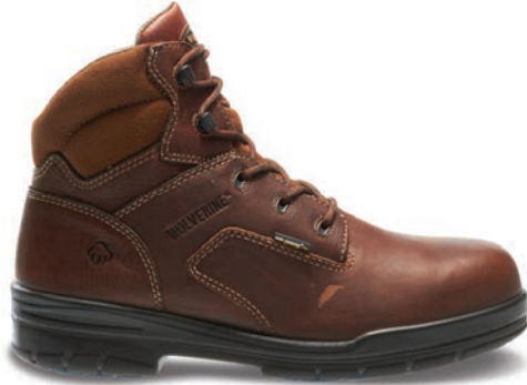
6" Dark Brown W10331 Composite-Toe