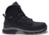
6" Black W10647 Composite-Toe W10649 Soft-Toe