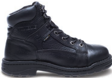
6" Black W04421 Steel-Toe