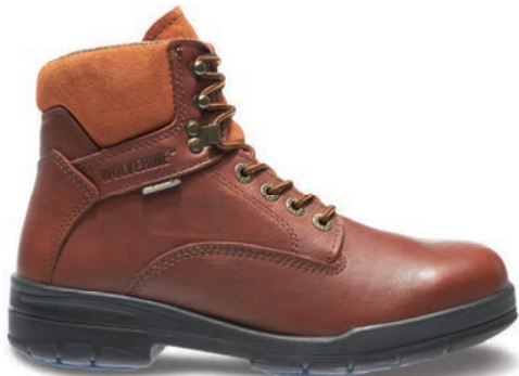
6" Brown W03120 Steel-Toe W03122 Soft-Toe BEST SELLER