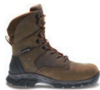
8" Summer Brown W10645 Composite-Toe