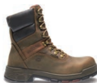
8" Dark Brown W10316 Composite-Toe W10317 Soft-Toe