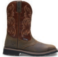
Rust/Brown W10764 Steel-Toe NEW W10767 Soft-Toe NEW