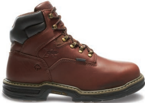
6" Dark Brown W02406 Steel-Toe