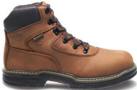
6" Brown W02161 Steel-Toe W02162 Soft-Toe