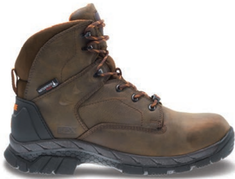
6" Summer Brown W10646 Composite-Toe W10648 Soft-Toe