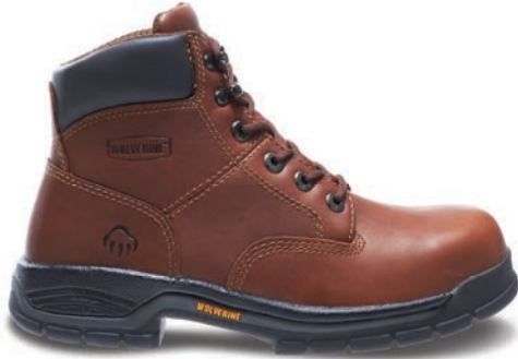
6" Brown W04675 Steel-Toe W04677 Soft-Toe