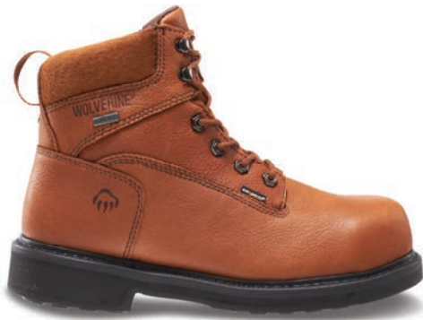
6" Tan W02564 Composite-Toe