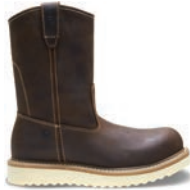
10" Brown W10740 Steel-Toe NEW