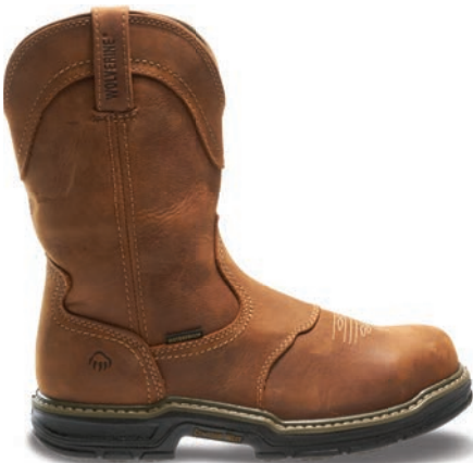
10" Brown W02287 Steel-Toe BEST SELLER W02288 Soft-Toe BEST SELLER