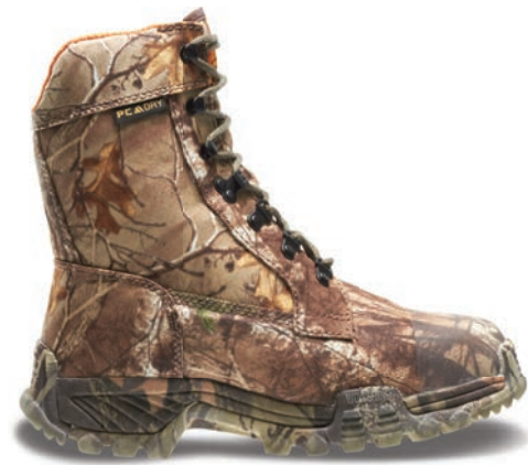
9" RealTree™ Xtra W30105 Soft-Toe