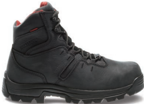
6" Black W04406 Steel-Toe