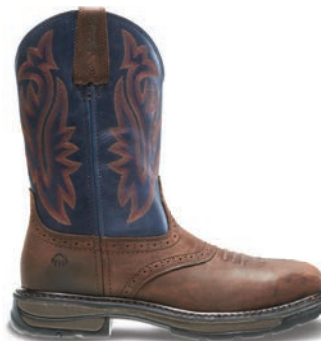
10" Blue W10244 Steel-Toe