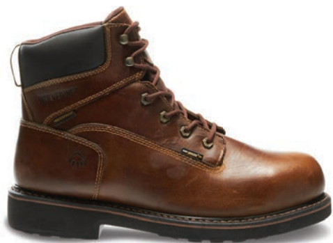
6" Brown W10080 Steel-Toe W10081 Soft-Toe