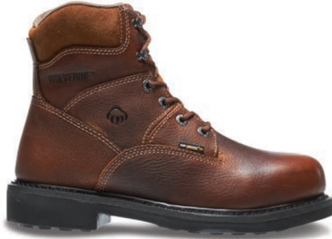
6" Brown W04326 Soft-Toe