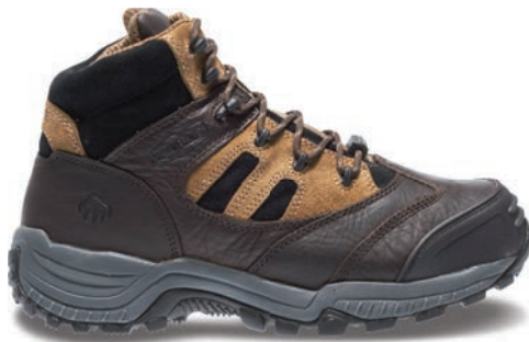
Mid-Cut Brown W05094 Composite-Toe