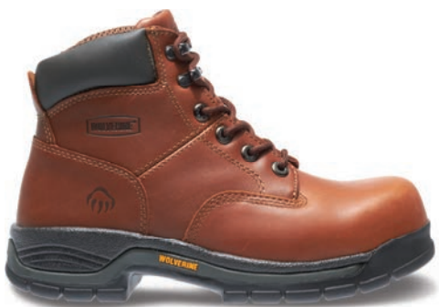
6" Brown W04904 Steel-Toe** W04906 Soft-Toe**