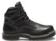
6" Black W02420 Steel-Toe