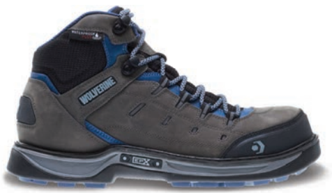
5.5" GREY/BLUE W10664 Composite-Toe