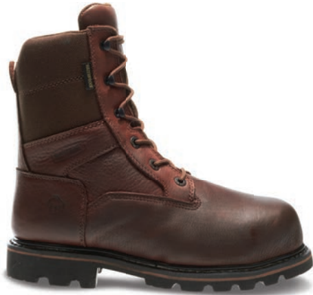
8" Brown LX W03513 Composite-Toe/INS W03511 Soft-Toe/INS