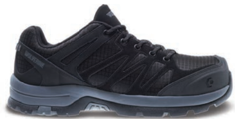
Black W10578 Composite-Toe