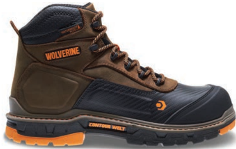
Summer Brown W10717 Composite-Toe NEW W10720 Soft-Toe NEW