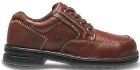
Lace-Up Brown W04501 Steel-Toe