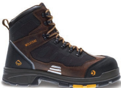
6" Brown W10654 Composite-Toe W10683 Soft-Toe