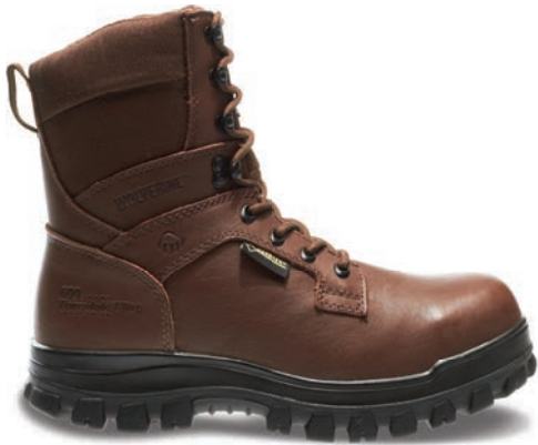
8" Angora/Maxi® Brown W04795 Steel-Toe