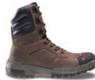
8" Dk Brown W10610 Composite-Toe