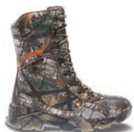
10" RealTree Xtra W20471