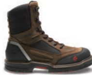
8" Brown/Black W10487 Composite-Toe W10625 Soft-Toe*