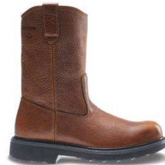
10" Brown W08377 Steel-Toe