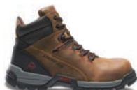
6" Brown W10305 CM Safety-Toe