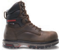
8" Dk Brown W10616 Composite-Toe