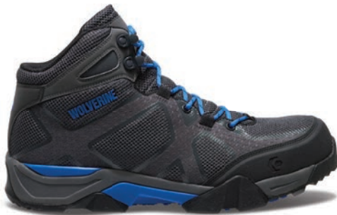
Grey/Blue W10564 Composite-Toe