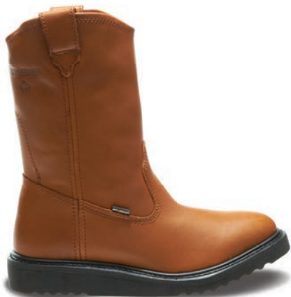
10" Tan W04695 Soft-Toe