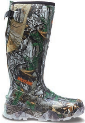
RealTree Xtra W20474 W20479