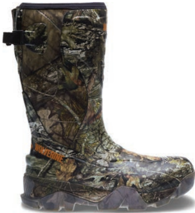
14" Real Tree Xtra W20483 Soft-Toe NEW