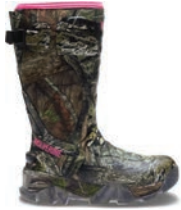
14" RealTree Xtra W20485 Soft-Toe NEW