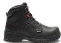
6" Black W10112 Composite-Toe