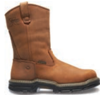
10" Brown W02165 Steel-Toe W02166 Soft-Toe