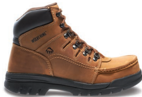
6" Brown W04349 Steel-Toe BEST SELLER