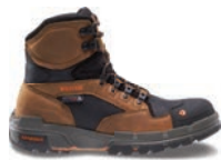
6" Tan W10611 Composite-Toe BEST SELLER