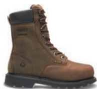
8" Brown W05680 Steel-Toe