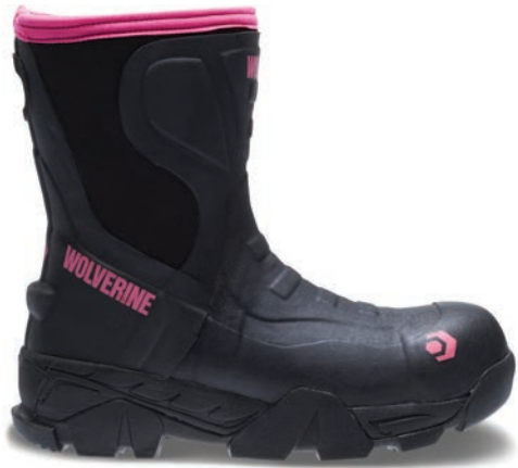
10" Black W10739 Composite-Toe NEW