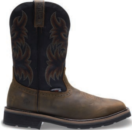
Black/Brown W10765 Steel-Toe NEW