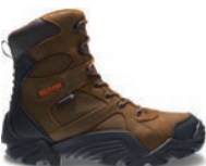
Brown W20493 Soft-Toe NEW