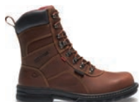
8" Brown W02353 Steel-Toe