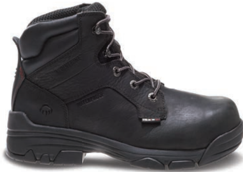
6" Black W10258 Composite-Toe