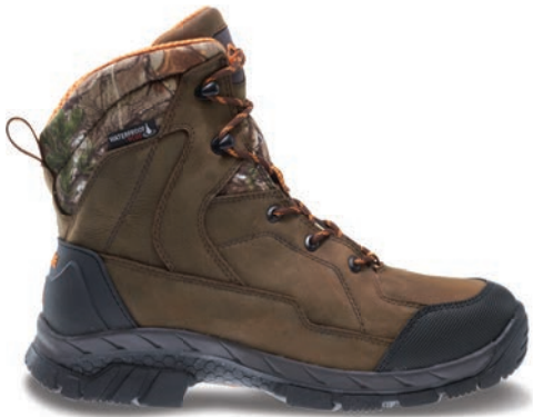
Summer Brown W20465