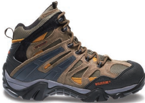
Gunmetal W05745 Soft-Toe