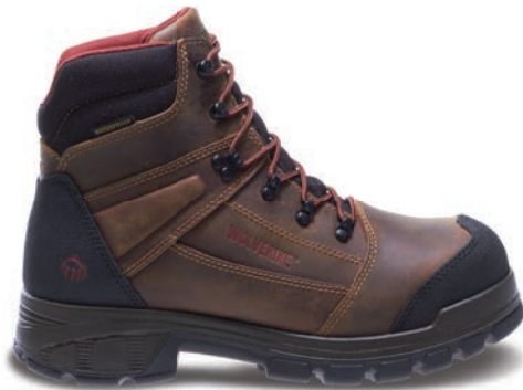
6" Brown W10505 Composite-Toe