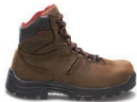
6" Brown W04405 Steel-Toe W04417 Soft-Toe