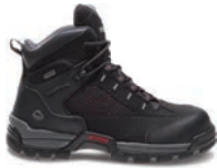
6" Black W02363 CM Safety-Toe