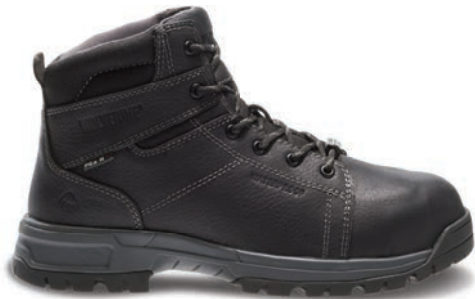
6" Black W10210 Composite-Toe