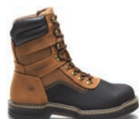
8" Brown W02256 Composite-Toe**