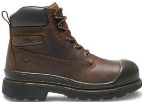
6" Dark Brown W04661 Steel-Toe