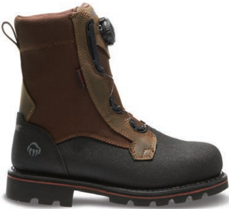
8" Brown/Boa W10308 Steel-Toe