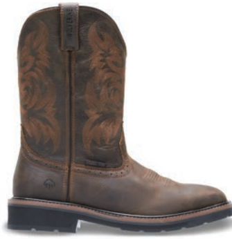
DK BROWN W10702 Steel-Toe W10704 Soft-Toe WB0006/0575