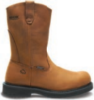
10" Tan W06683 Steel-Toe W06684 Soft-Toe