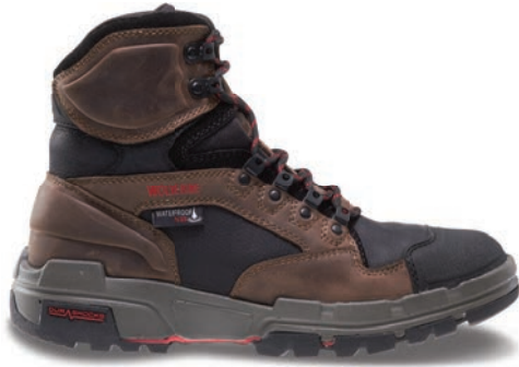
6" Dk Brown W10612 Composite-Toe W10634 Soft-Toe

WOLVERINE DURASHOCKS® COMFORT TECHNOLOGY