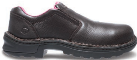
Slip-On Brown W10192 Steel-Toe