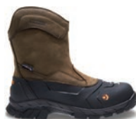
Dk Brown W10733 Composite-Toe NEW