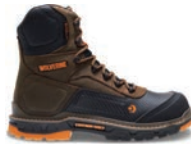
Summer Brown W10711 Composite-Toe NEW W10713 Soft-Toe NEW