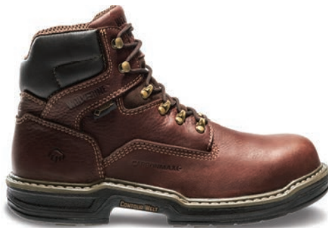
6" Peanut W10503 Composite-Toe