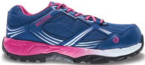
Navy/Pink W10671 Composite-Toe