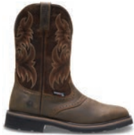
Dk Brown/Brown W10763 Steel-Toe NEW W10766 Soft-Toe NEW