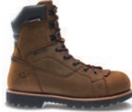
Brown W20469 Composite-Toe INS