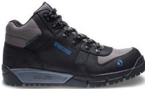
Black W10725 Composite-Toe NEW