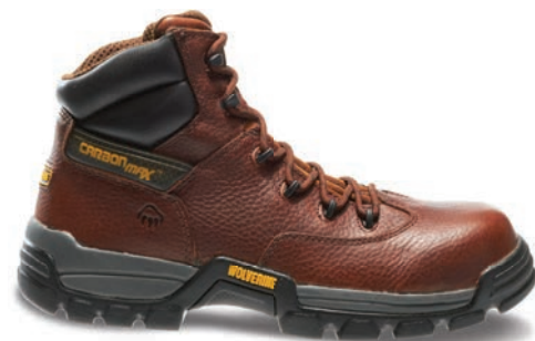
6" Brown W02292 CM Safety-Toe