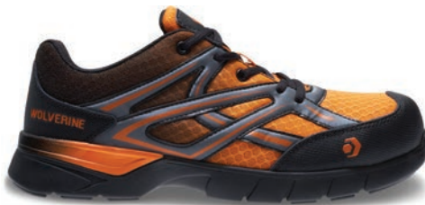
Charcoal/Orange W10751 Composite-Toe NEW