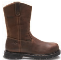
10" Dark Brown W10108 Composite-Toe