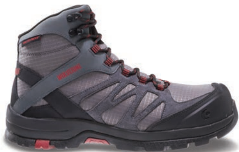
Mid-Cut Grey W10490 Composite-Toe