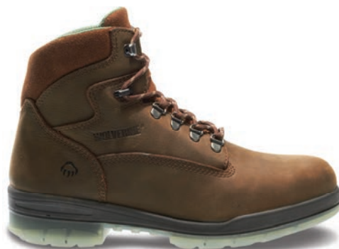
6" Brown W03294 Steel-Toe W03226 Soft-Toe