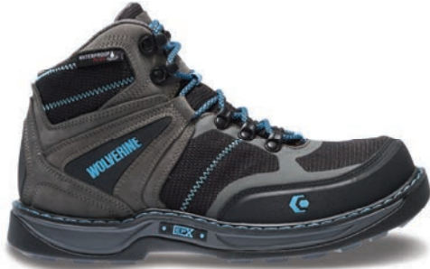
Grey/Blue W10550 Composite-Toe