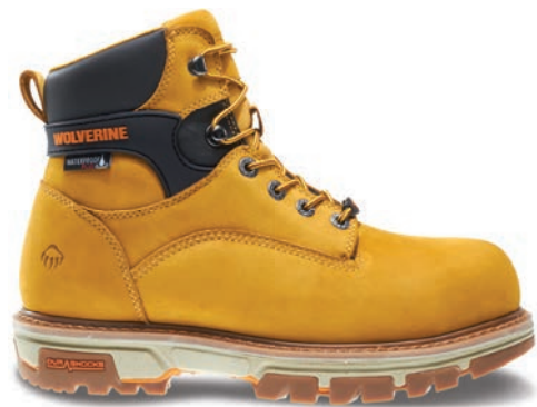
6" Wheat W10622 Composite-Toe INS