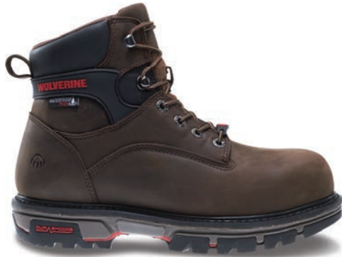
6" Dk Brown W10620 Composite-Toe W10636 Soft-Toe