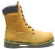
8" Gold W01195 Soft-Toe