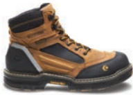
6" Wheat/Tan W10485 Composite-Toe