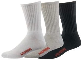
White 100 Grey 020 Black 001