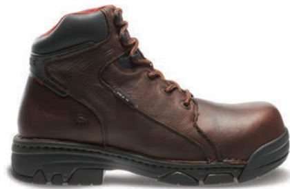
6" Brown W02376 Composite-Toe