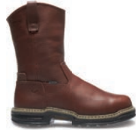
10" Dark Brown W02359 Steel-Toe*