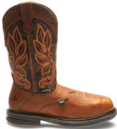
10" Brown W10511 Composite-Toe