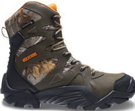
Brown/Real Tree W20492 Soft-Toe NEW