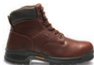
6" Dark Brown W05685 Soft-Toe/Gore-Tex®