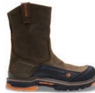
Dark Coffee W10708 Composite-Toe NEW W10709 Soft-Toe NEW