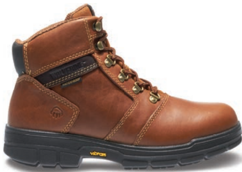
6" Brown W04104 Soft-Toe