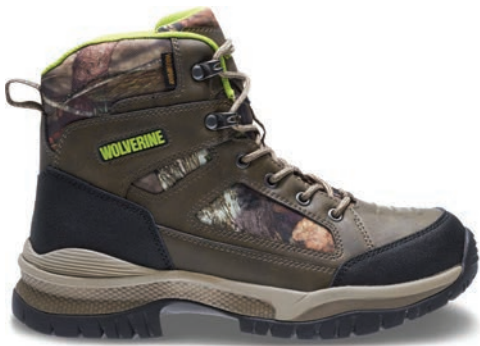
6" Natural/Mossy Oak W20497 Non Insulated Soft-Toe NEW