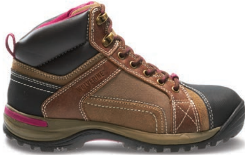
Mid-Cut Dark Brown W10349 Steel-Toe