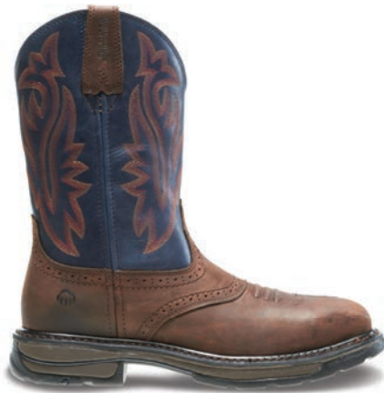
10" Blue W10244 Steel-Toe