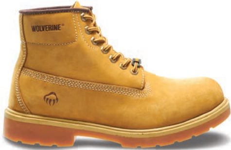
6" Gold W10286 Soft-Toe