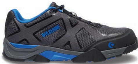
Black/Grey/Blue W10568 Composite-Toe