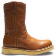
10" Tan W08285 Soft-Toe