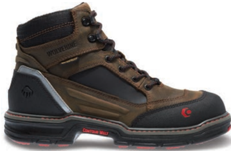
6" Brown/Black W10483 Composite-Toe BEST SELLER W10626 Soft-Toe*