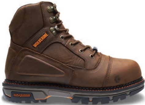
6" DK Brown W10732 Composite-Toe NEW