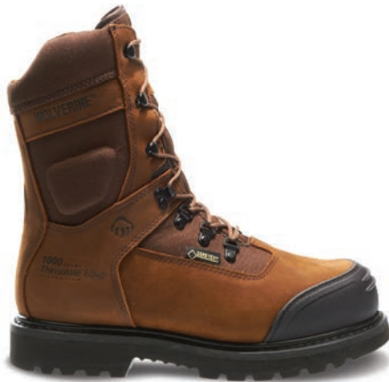
8" Brown/Maxi® Brown W05551 Composite-Toe