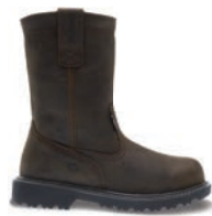
10" Dk Brown W10699 Steel-Toe W10700 Soft-Toe