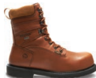
8" Tan W02566 Composite-Toe W02565 Soft-Toe