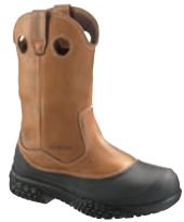
6" Tan W05699 Steel-Toe