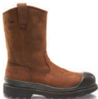
10" Dark Brown W04664 Steel-Toe