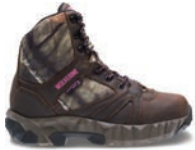
Brown/Mossy Oak High W20481 Soft-toe NEW