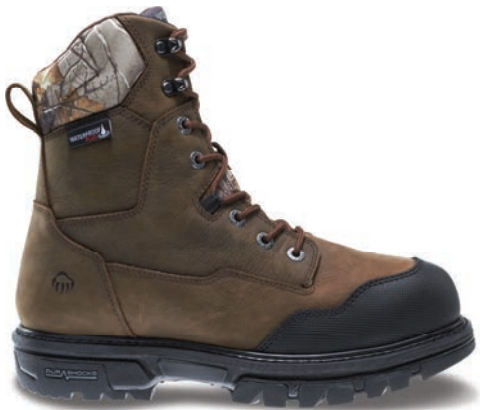
Brown/Real Tree W20476