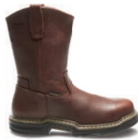
10" Dark Brown W04826 Steel-Toe** W04827 Soft-Toe**