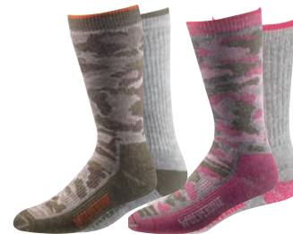
Camo 990 Camo 990