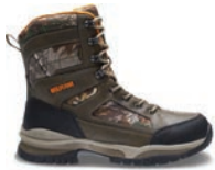
Natural/Mossy Oak High W20494 Insulated Soft-Toe NEW