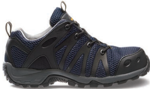
Navy Blue W02300 Composite-Toe