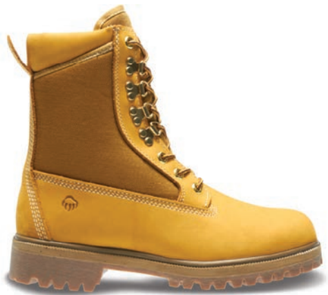
8" Gold W01199 Soft-Toe