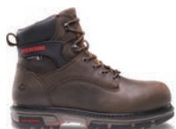
6" Dk Brown W10623 Composite-Toe INS W10641 Soft-Toe