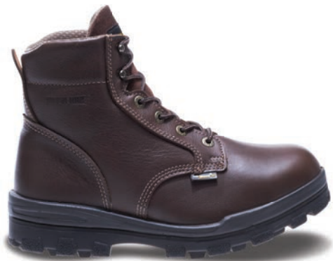
6" Brown W03177 Steel-Toe