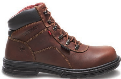
6" Brown W02349 Steel-Toe