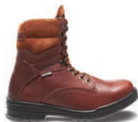
8" Brown W03126 Soft-Toe