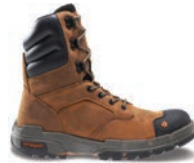
8" Tan W10609 Composite-Toe