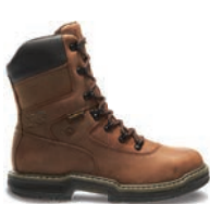
8" Brown W02163 Steel-Toe W02164 Soft-Toe