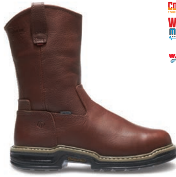
10" Dark Brown W02359 Steel-Toe