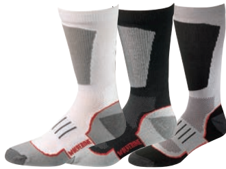
White 100 Black 001 Grey 020