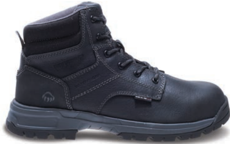
6" Black W10177 Composite-Toe