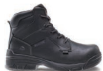
6" Black W10502 Composite-Toe