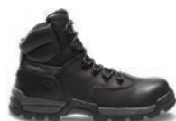
6" Black W02293 CM Safety-Toe