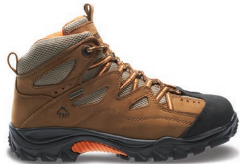
Mid-Cut Light Brown/Orange W02625 Steel-Toe