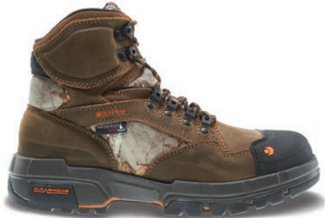
Brown/Real Tree W10639 Composite-Toe W20477 Soft-Toe