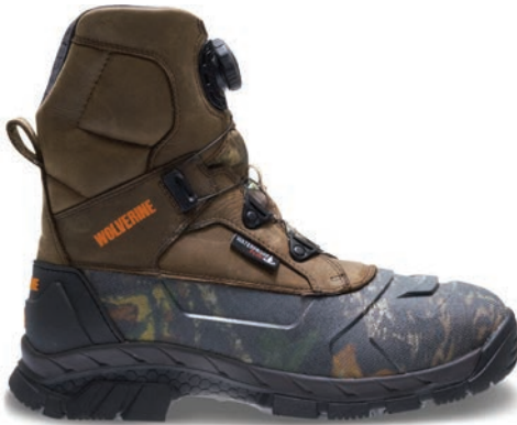
Brown/True Timber W20489 Soft-Toe NEW