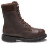
8" Dark Brown W04452 Steel-Toe*