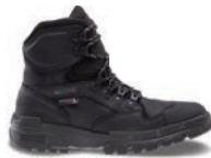
6" Black W10613 Composite-Toe W10635 Soft-Toe