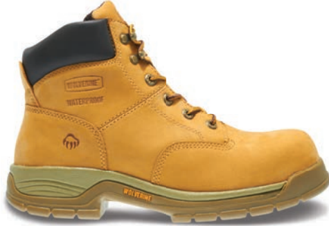
6" Wheat W05065 Steel-Toe