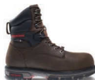
8" Dk Brown W10619 Composite-Toe INS