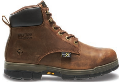
6" Brown W10361 Steel-Toe