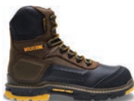
Dark Coffee W10715 Soft-Toe NEW W10712 Composite-Toe NEW