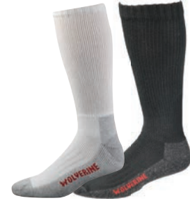
White 100 Black 001