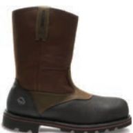
10" Brown W10309 Steel-Toe