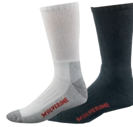
White 100 Black 001