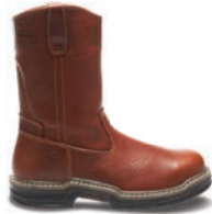
10" Brown W02427 Steel-Toe** BEST SELLER W02429 Soft-Toe** BEST SELLER