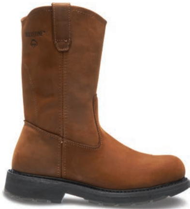
10" Brown W04707 Steel-Toe BEST SELLER W04727 Soft-Toe BEST SELLER