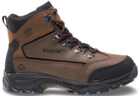
Brown W05103 Soft-Toe BEST SELLER