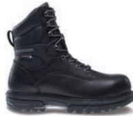
8" Black W10617 Composite-Toe