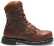
8" Brown W04327 Steel-Toe W04328 Soft-Toe