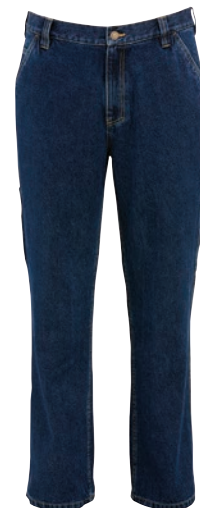
Dark Denim 401

Colors: Black 003, Bison 202, Whiskey 253, Realtree Xtra 996 Sizes: M-XXL (W1200920) 3X, 4X, LT-XXLT (W1203710)