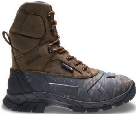
Brown W20488 Soft-Toe NEW