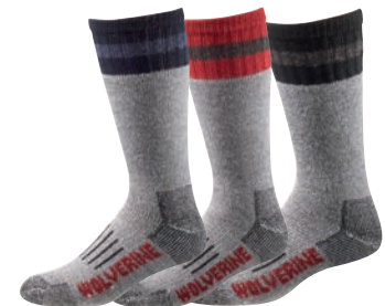
Navy 417 Red 600 Black 001