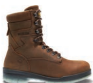
8" Brown W03295 Steel-Toe W03238 Soft-Toe