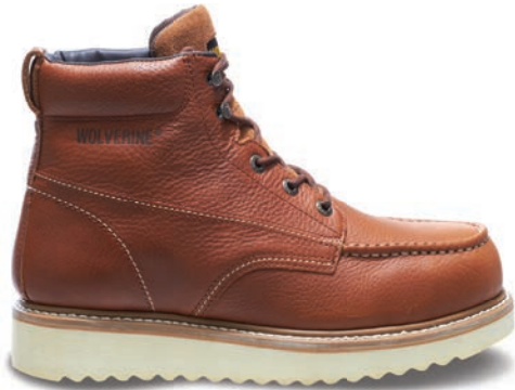
6" Tan W08289 Steel-Toe W08288 Soft-Toe BEST SELLER