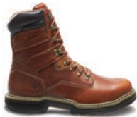
8" Brown W02423 Steel-Toe** W02425 Soft-Toe