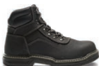
6" Black W02253 Composite-Toe