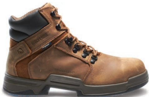
6" Tan W10213 Steel-Toe W10214 Soft-Toe