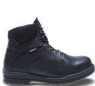
6" Black W03121 Steel-Toe W03123 Soft-Toe