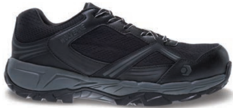
Black W10667 Composite-Toe