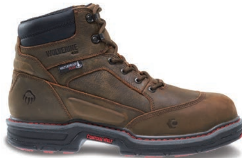
6" Brown W10628 Composite-Toe INS