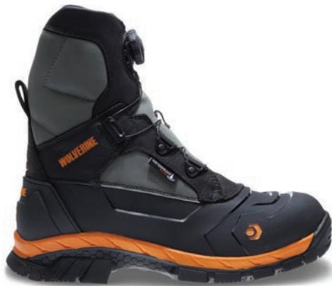
Black/Grey/Orange W10735 Composite-Toe NEW