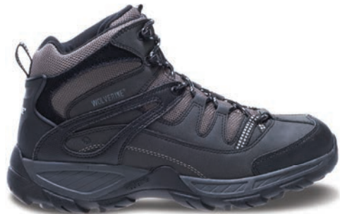
Mid-Cut Black/Grey W04117 Steel-Toe