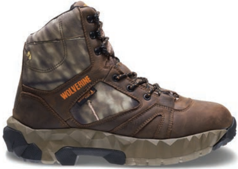
Brown/Mossy Oak High W20500 Soft-Toe NEW