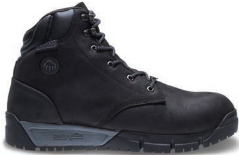
Black W10722 Composite-Toe NEW