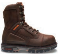
8" DK Brown W10731 Composite-Toe NEW