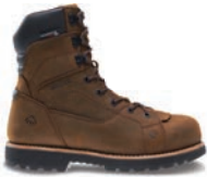
Brown W20468 Composite-Toe INS W20478 Soft-Toe