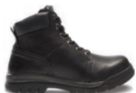
6" Black W04714 Steel-Toe W04736 Soft-Toe