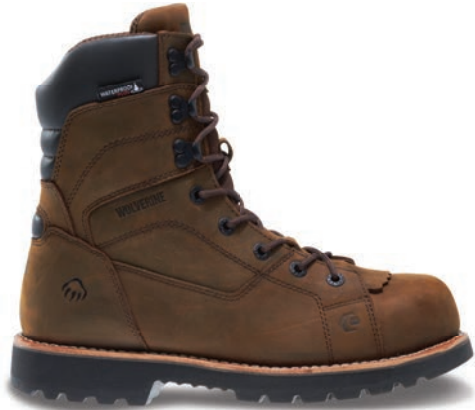
Brown W20467 Composite-Toe Non-INS