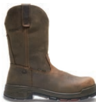
10" Dark Brown W10318 Composite-Toe BEST SELLER W10319 Soft-Toe