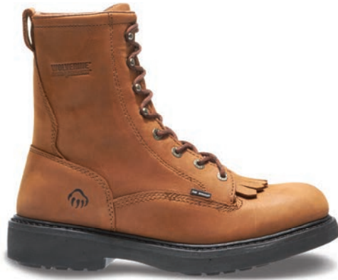
8" Tan W06682 Soft-Toe