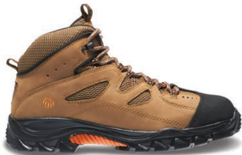
Mid-Cut Brown W06654 Steel-Toe