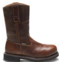
10" Brown W10084 Steel-Toe W10085 Soft-Toe