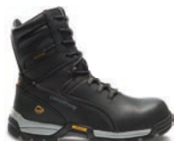
8" Black W10306 CM Safety-Toe