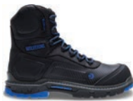
Black W10710 Composite-Toe NEW