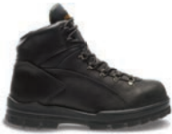
6" Black W03778 Steel-Toe