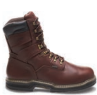
8" Dark Brown W02407 Steel-Toe