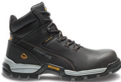
6" Black W10304 CM Safety-Toe