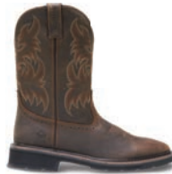
Dk Brown/Rust W10702 Steel-Toe Non Waterproof W10704 Soft-Toe Non Waterproof