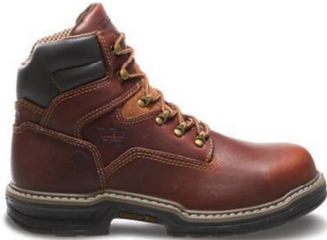
6" Brown W02419 Steel-Toe** BEST SELLER W02421 Soft-Toe** BEST SELLER