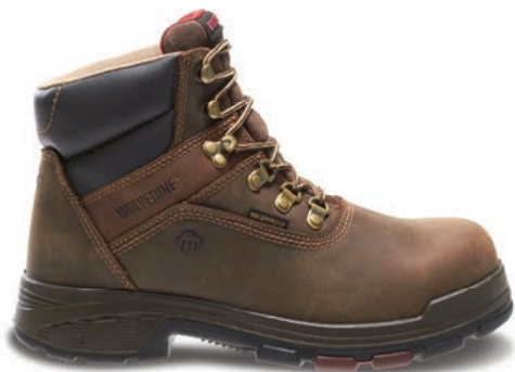
6" Dark Brown W10314 Composite-Toe BEST SELLER W10315 Soft-Toe BEST SELLER