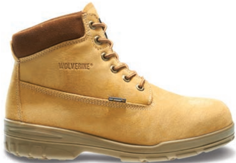
6" Gold W10323 Soft-Toe/INS