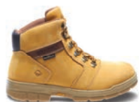
6" Gold (Nubuck) W04105 Soft-Toe