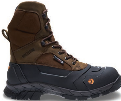
Brown/Black W10734 Composite-Toe NEW