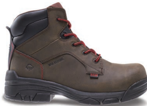
6" Dark Brown W10501 Composite-Toe