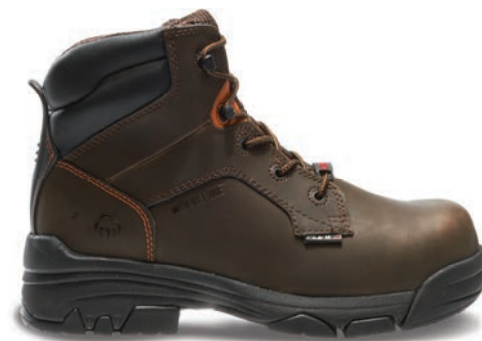
6" Brown W10113 Composite-Toe