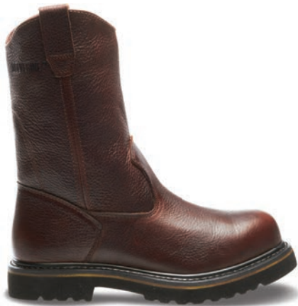
10" Peanut W03146 Steel-Toe W03246 Soft-Toe