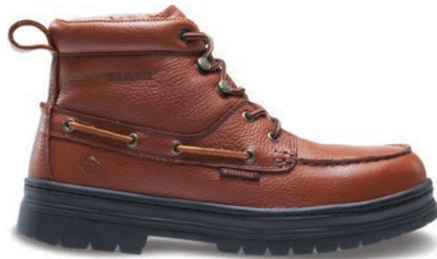
6" Brown W08404 Steel-Toe