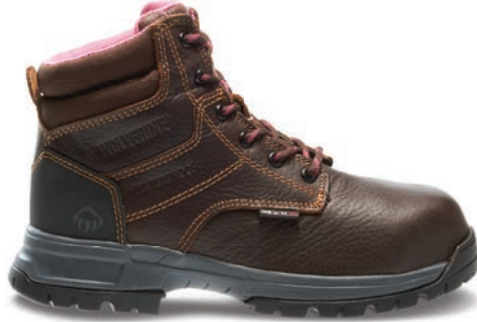
6" Brown W10180 Composite-Toe BEST SELLER W10182 Soft-Toe