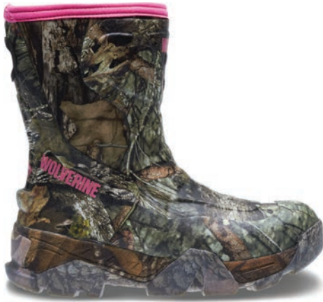
10" RealTree Xtra W20486 Soft-Toe NEW