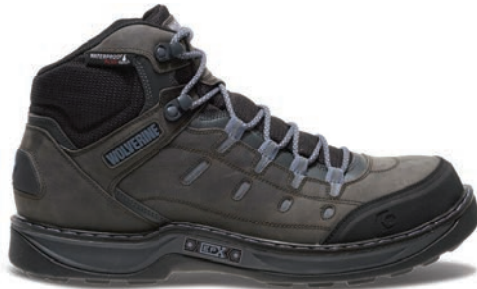
Grey/Blue W10551 Composite-Toe