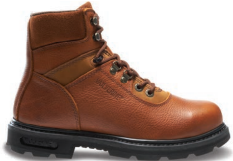
6" Brown W04013 Steel-Toe