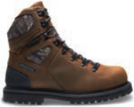
Brown/Mossy Oak W20499 Non Insulated NEW