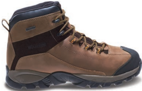
Mid-Cut Cigar/Gold W10397 Steel-Toe