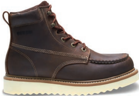
6" Brown W10744 Soft-Toe NEW W10742 Steel-Toe NEW