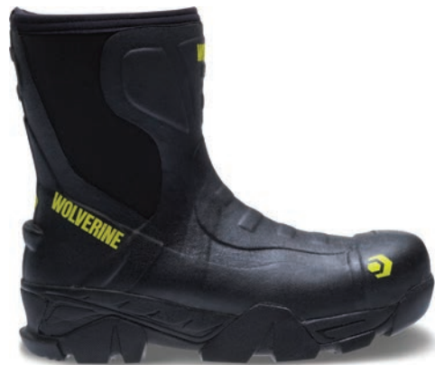
10" Black W10737 Composite-Toe NEW