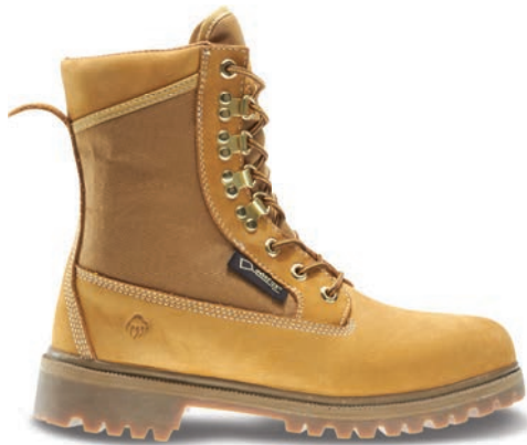
8" Gold W01214 Soft-Toe