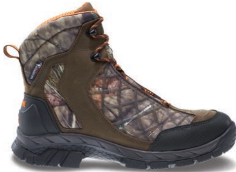
Brown/Real Tree W20466