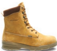
8" Gold W10325 Soft-Toe/INS