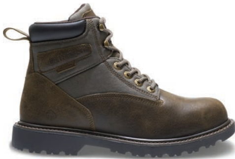
Olive W10760 Soft-Toe NEW