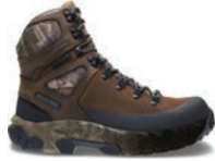
Brown/Mossy Oak W20498 Soft-Toe NEW