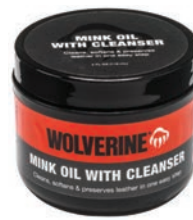
W69407 Wolverine Mink Oil With Cleanser 12 Per Unit