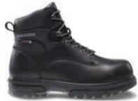
6" Black W10621 Composite-Toe