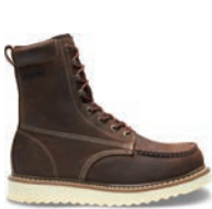
8" Brown W10743 Soft-Toe NEW W10741 NEW