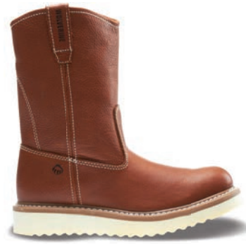
10" Tan W08285 Soft-Toe