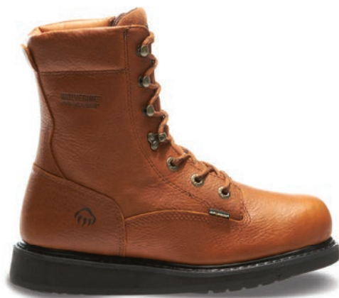
8" Tan W02639 Soft-Toe