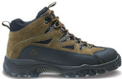
Tan/Black W05107 Soft-Toe