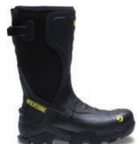
14" Black W10736 Composite-Toe NEW