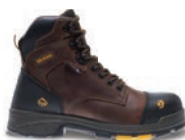
6" Brown W10706 Met-Guard