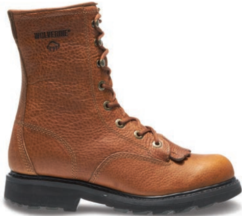
8" Tan W08393 Steel-Toe W08394 Soft-Toe