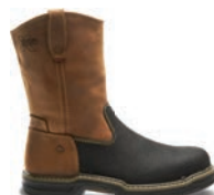
10" Brown W02285 Composite-Toe