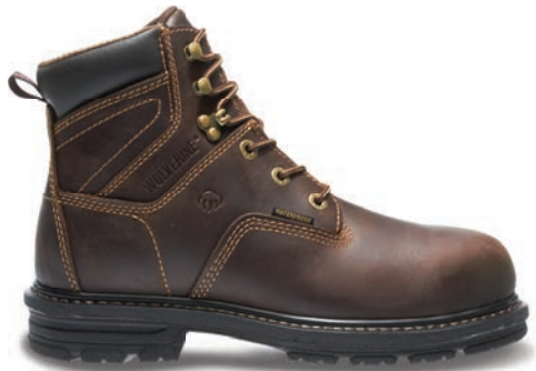
6" Dark Brown W10103 Composite-Toe