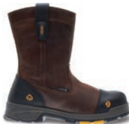
10" Brown W10650 Composite-Toe