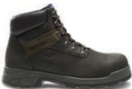
6" Black W10326 Composite-Toe