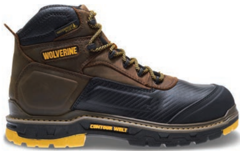
Dark Coffee W10721 Soft-Toe NEW W10718 Composite-Toe NEW