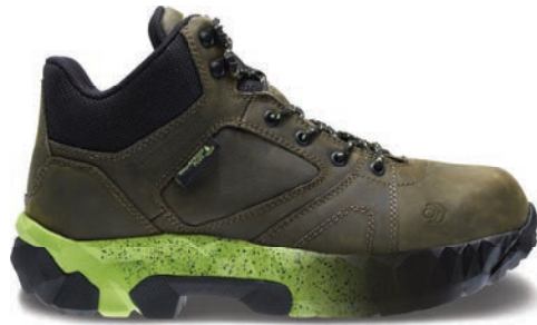
Black W10727 Composite-Toe NEW