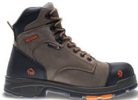
6" Chocolate Chip W10653 Composite-Toe W10707 Soft-Toe