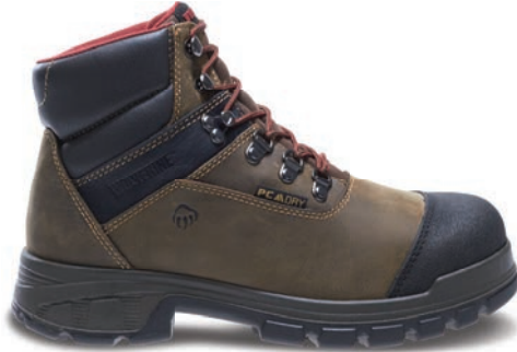
6" Brown W10371 Composite-Toe