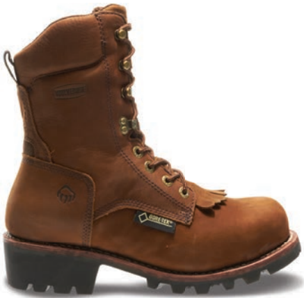
8" Brown W05523 Steel-Toe