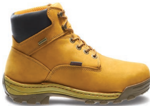
6" Wheat W04780 Soft-Toe